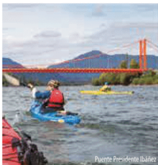
Puente Presidente Ibañez

The main port of Aysen Region, located 81 km from Coyhaique and from where ferries sail to San Rafael Lagoon. As also an endless journey through fjords and channels that give life to all the coast of this dismembered region. This vast and insular geography together with snowy mountains and exuberant and colorful vegetation form, as in a painting, an impressive landscape at the end of the world.