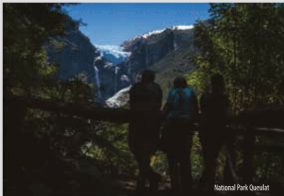
National Park Queulat

The fjords and channels of Aysen are characterized by its scattered zone with its several islands and islets of exuberant vegetation. You will enjoy trail through evergreen forest, archeological sites, sea wildlife as birds, sea lions, dolphins and whales. Also in this zone are some towns as Melinka, Repollal, Puerto Gala, Puerto Cisnes, Puerto Aguirre, Raúl Marín Balmaceda, Melimoyu and others. Here you will know the culture of the fishermen who live between the sea and the land.